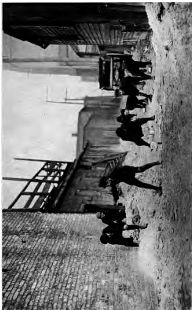
THE NORMAL BOY IN THE ABNORMAL PLAYGROUND